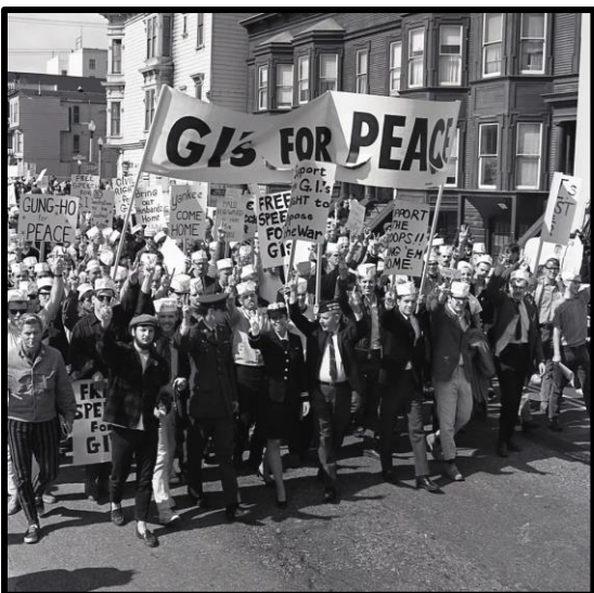
GI's protest against the Vietnam War.