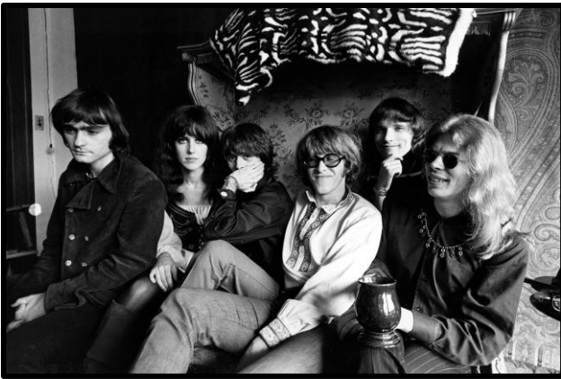
San Francisco's own rock band: The Jefferson Airplane.