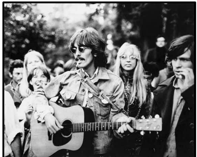
George Harrison and Pattie Boyd in the Haight Ashbury.