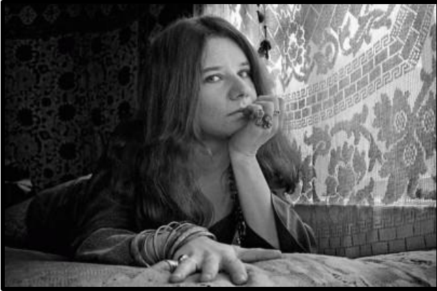
Janis Joplin in her Lyon Street apartment.