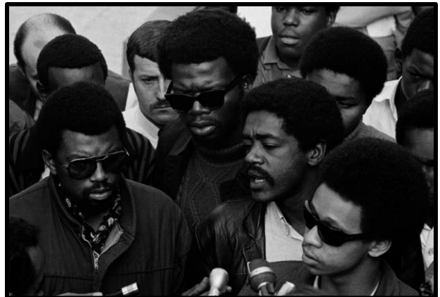
The student-led strike at San Francisco State University.