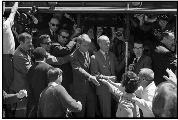
Bobby Kennedy on a cable car during his campaign for President.