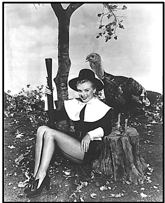
Western gal Marilyn Monroe imitating a sexy pilgrim for a Thanksgiving photo shoot. (Sexy pilgrim? Now there's an oxymoron for you!) Happy Turkey Day to you and yours.